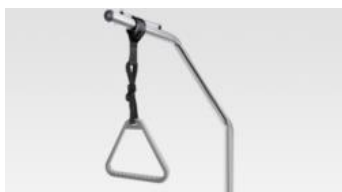
RA0050 -LIFTING POLE