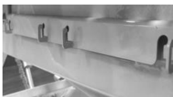
RA0076 -COUPLE OF SUPPORTS FOR BAGS FOR THEOS/VIRGO II/VEGA BEDS