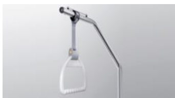
RA0053 -LIFTING POLE, ADJUSTABLE THROUGH BUTTON