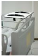
RA9595 -SHAPED SUPPORT FOR MONITOR