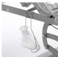
RA0080 -URINAL SUPPORT