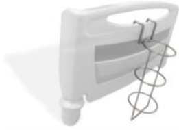
RA0146 -OXYGEN TANK HOLDER WITH LATERAL FIXING MADE OF STEEL FOR HT0318 HEAD/FOOT PANELS